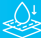
Lead Reduction Carbon Block

Reduces chlorine, chemicals, and pesticides.